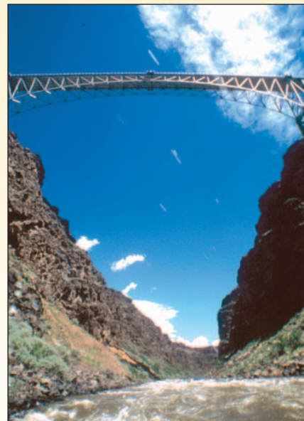
The Rio Grande Gorge Bridge

Traveling through the Moreno Valley from Eagle Nest, the next stop is a visit with the ghosts in Elizabethtown. Established as the first incorporated city in New Mexico in the late 1860's, Eliza-